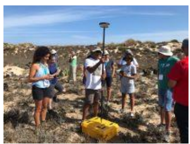
Figure 6. Field work, lab processing data and 2" pitch presentations during the first edition of the summer school.

The first edition of the summer school was held from the 11<sup>th</sup> and the 17<sup>th</sup> of September of 2022, in collaboration with the Institute Dom Luiz, an associated laboratory of FCUL, in the scope of the doctoral programme "Earthsystems". The general theme was "Land-Atmosphere-Ocean interactions in a changing planet - A hands-on approach to Earth System observation and modelling". It had the participation of 25 students from 7 universities, both national and international. The training sessions were delivered by 26 researchers from 5 universities (ULisboa, UAveiro, UCoimbra, UÉvora and UCádiz), 1 State Laboratory (IPMA, I.P.) and 3 associated laboratories (IDL, CESAM, ARDITI) (Figure 6).