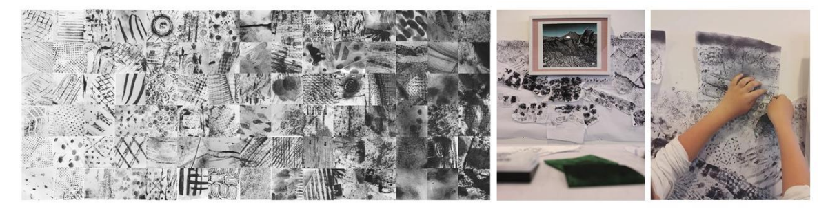
Figure 1. Dynamics and textures obtained in the module at Tatiana Binimelis. Photo-Essay.

Figure 2 gathers in a word cloud the impressions of 100 students after visiting the exhibition. These were collected from a guestbook offered to anyone who wished to leave their impressions.