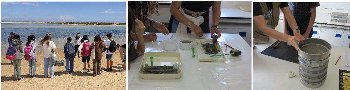
Figure 2. "What is the sand made of?" activity. 13th October 2022, secondary - 11th year.