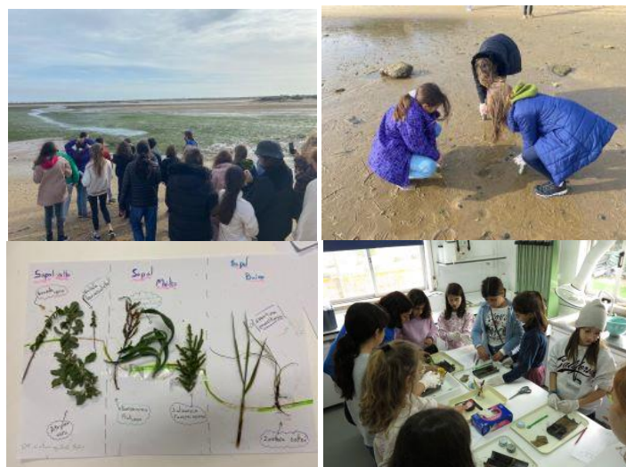
Figure 3. "Let's get to know the saltmarsh" activity- 12 th December 2022. 5 th year.

- "Let's get to know the saltmarsh" - In this activity students collect sediment samples and plants/algae in order to better define the saltmarsh zones (low, medium, and high marsh). At the lab, they perform the grain size analysis as well as identify the sediment colour with the aid of a standard chart. They identify the plants as well by making an herbarium (Figure 3).